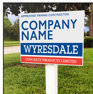
Personalised Site Signage

Becoming a Wyresdale Concrete Products Approved Contractor also allows you to gain rewards from the Loyalty Scheme